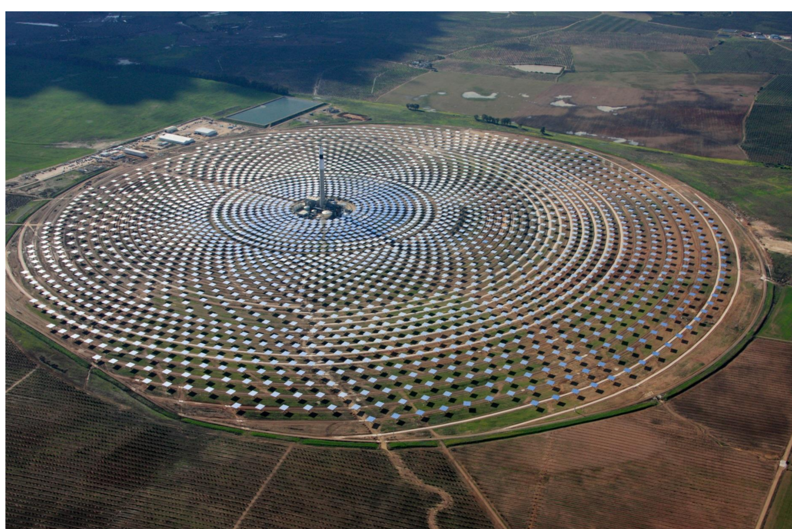
Figure 1: Comparable-sized 20 MW power plant near Seville, Spain. 2650 heliostats spread across 185 hectares (Gemasolar)

The 25 MW e reference plant requires approximately 250,000m 2 of heliostat mirror surface. Typically the heliostat field is around 30-50% 1 of the capital cost of a plant. As of 2013 2 , the cost of a heliostat is estimated to be in the range of $US150-200/m 2 ($AU200-270/m 2 ) By reducing the cost down to $AU90/m 2 the cost of a 25 MW e plant can be reduced by as much as $AU45million.