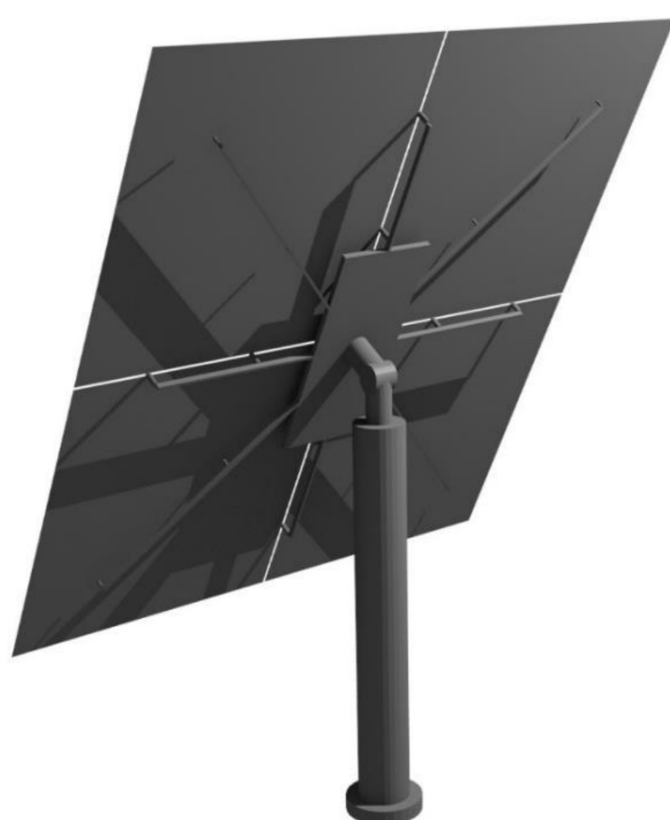
Figure 3: Illustration of heliostat concept.