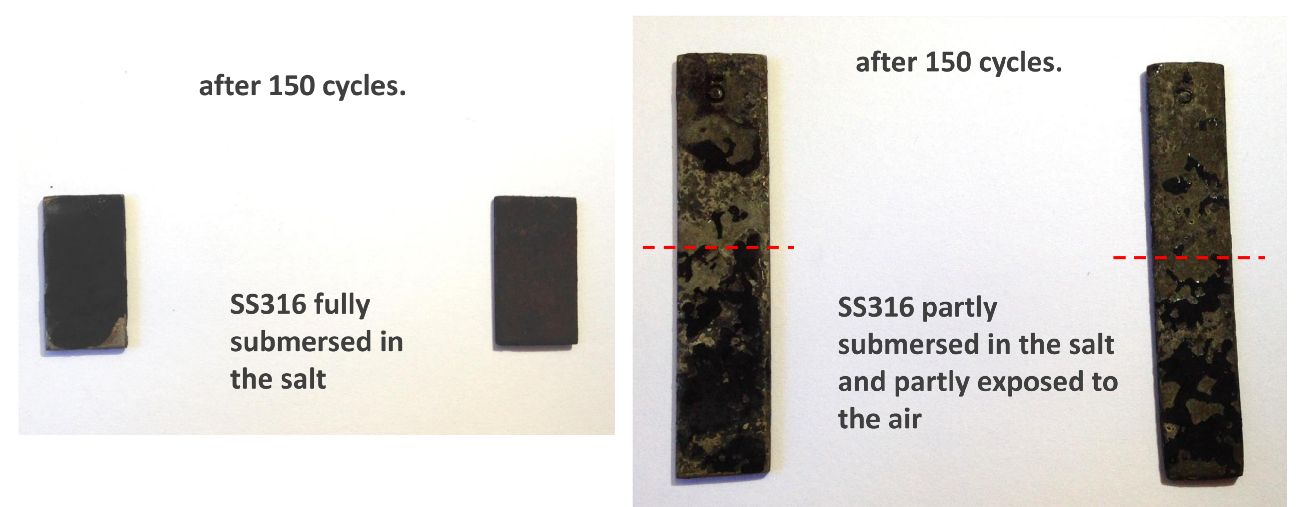
Figure 4: Pictures of SS316 samples after cycling test.