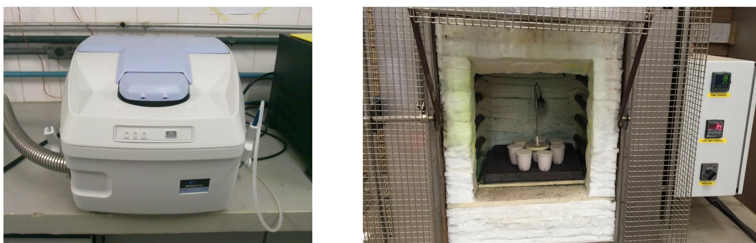
Figure 2: Pictures of DSC (left) and high temperature furnace (right) at UniSA.